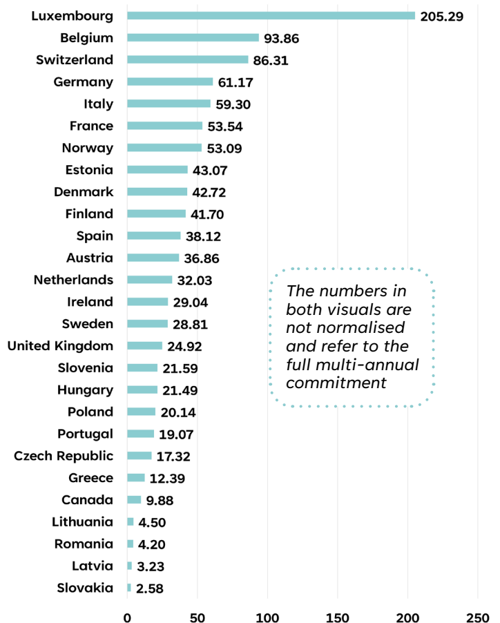
Figure 2: CM25 subscriptions per capita

The numbers in both visuals are not normalised and refer to the full multi-annual commitment